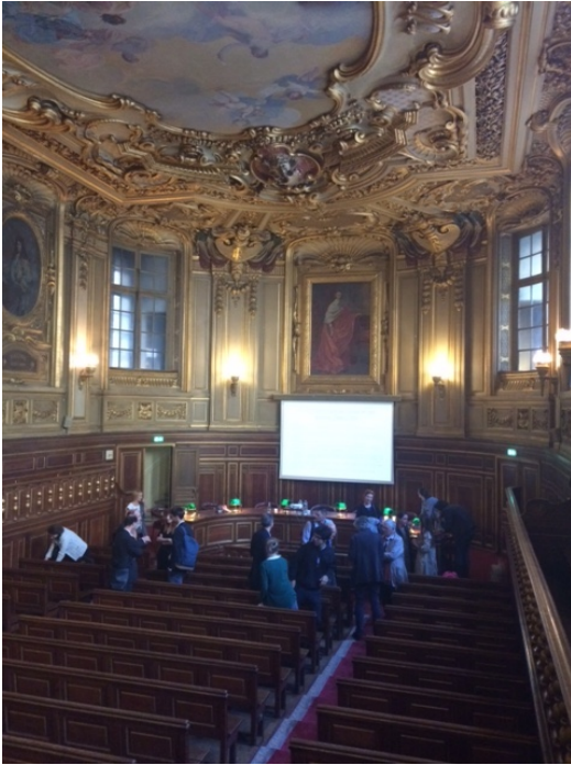
The Louis Liard Amphitheatre at the Sorbonne, where the colloquium took place.